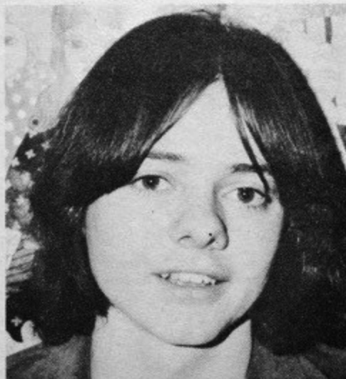
Jack Wild 68