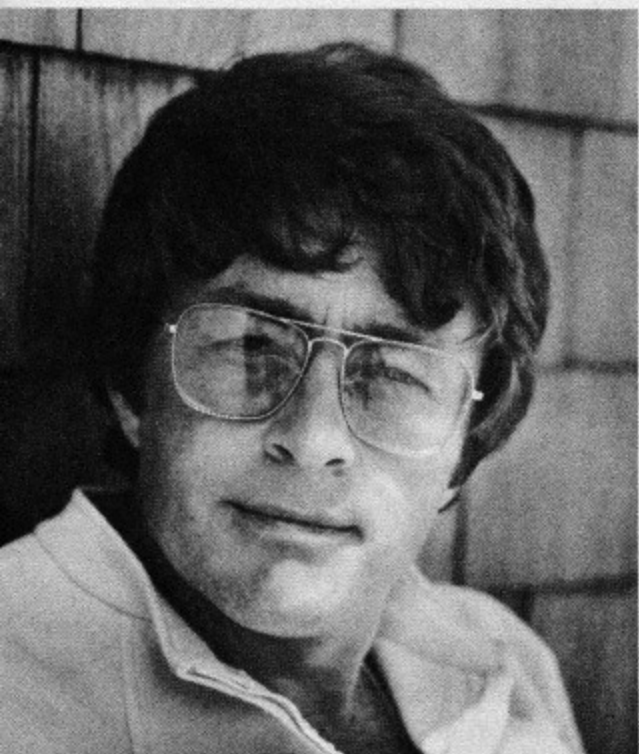
According to a recent co-star, handsome Bill Bixby is a top actor to work with.

both reported to be buying houses here . . . JOHN KAY of STEPPEWOLF won the yearly "boogeying contest" at the Whiskey. Congratulations, John!