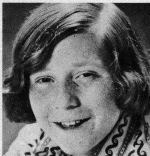
DANNY BONADUCE BRIAN FORSTER