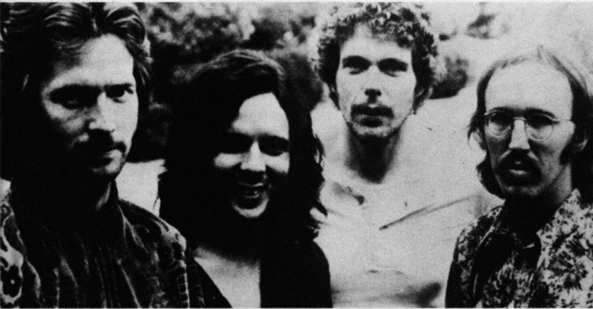
Eric Clapton of Derek and the Dominos was recently honored by his fellow musicians.

board," they've been voted number one in polls all over the world—in such countries as Switzerland, Holland, Great Britain, Mexico, Israel and New Zealand.