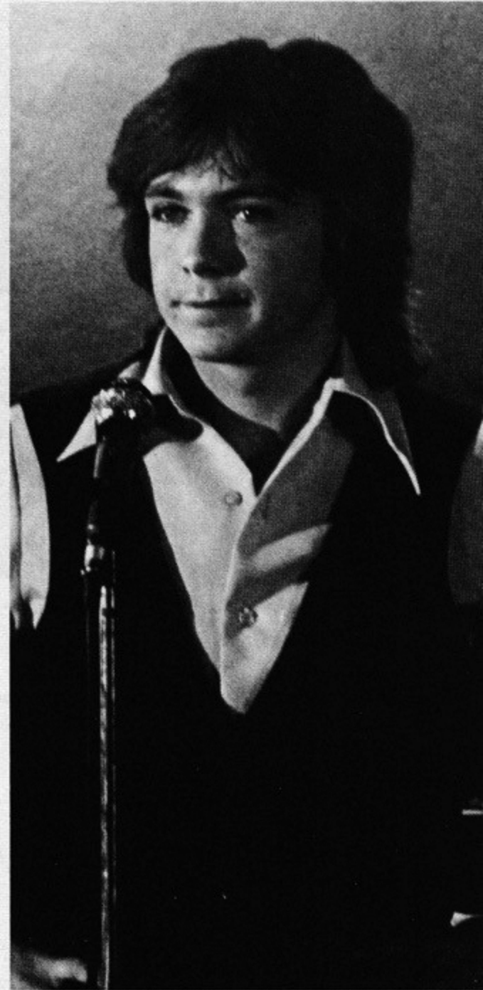
David Cassidy recently spent quite a hectic day moving out of his rustic hill-top home.