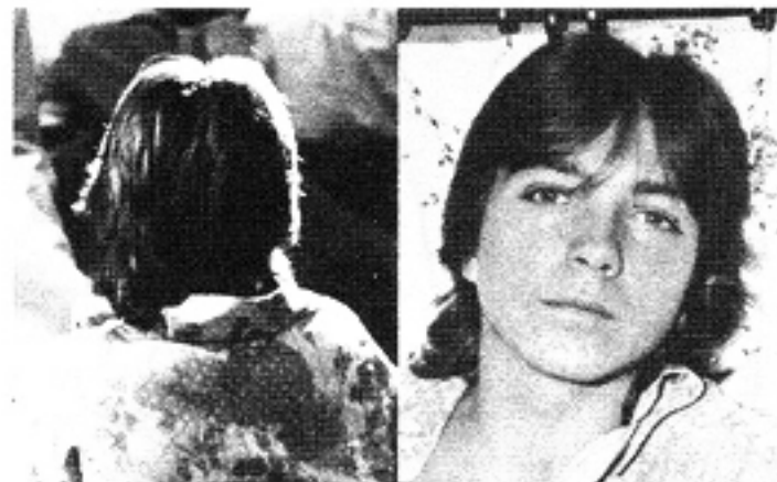
2. That's David Cassidy—turned around!