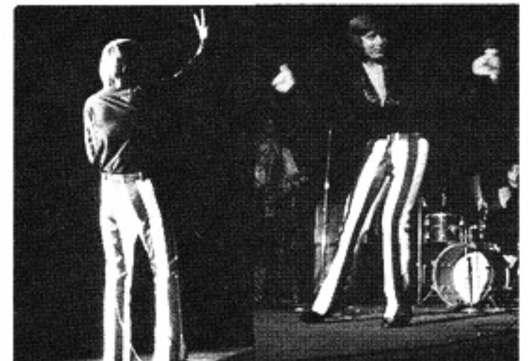
3. It's Bobby Sherman—in his famous striped pants!