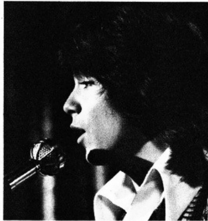
Above: David Cassidy's golden voice earned him more than a million dollars last year. Below: Dicken's famous relative Brian Forster.