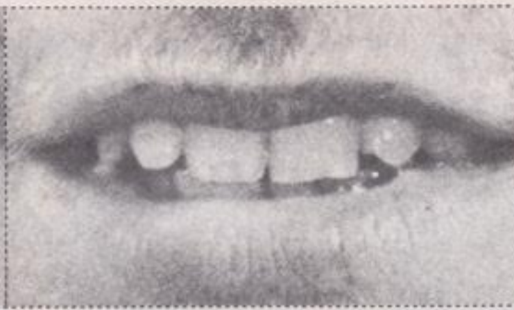
THE LIPS OF BUTCH PATRICK!