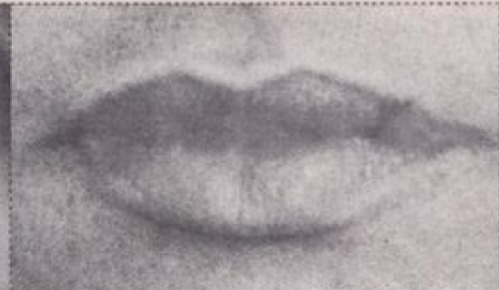
THE LIPS OF MICHAEL JACKSON!