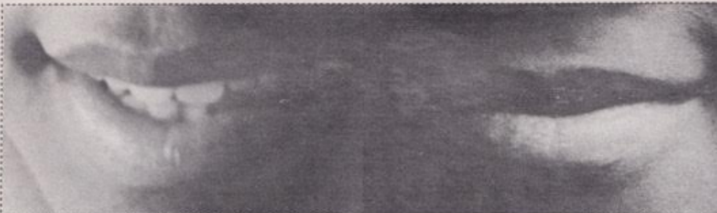
THE LIPS OF JERMAINE JACKSON!