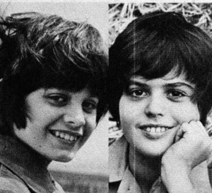
Brook & — Donny! Look-alikes?