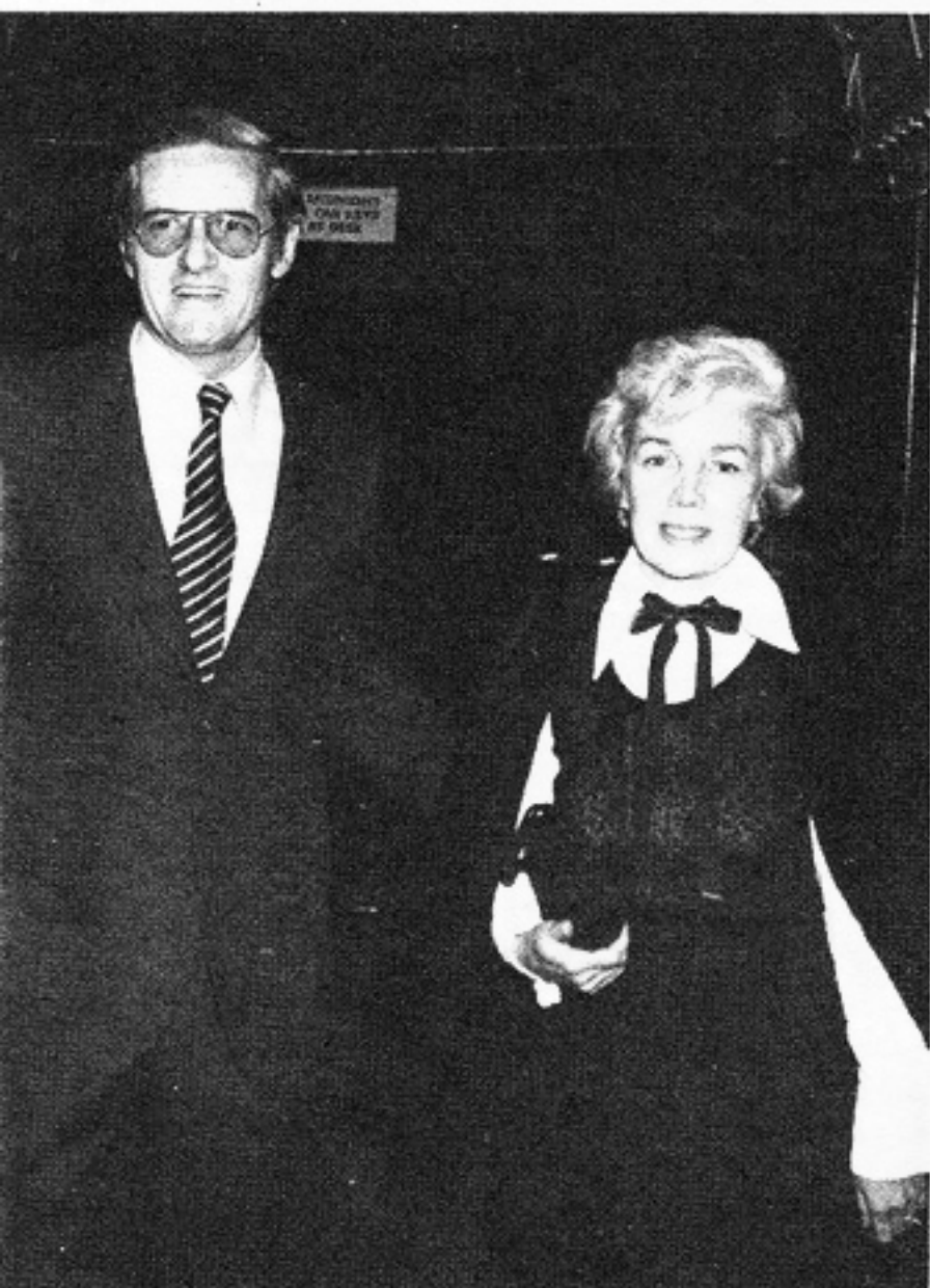
Arthur Hill's new show this season is Owen Marshall, and it's doing great!