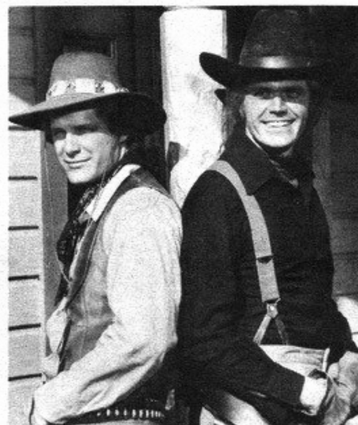
Ben Murphy & Roger Davis