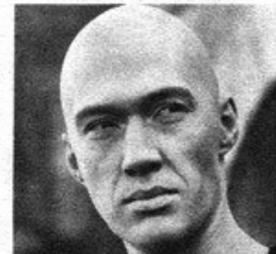
David Carradine "Kung Fu"