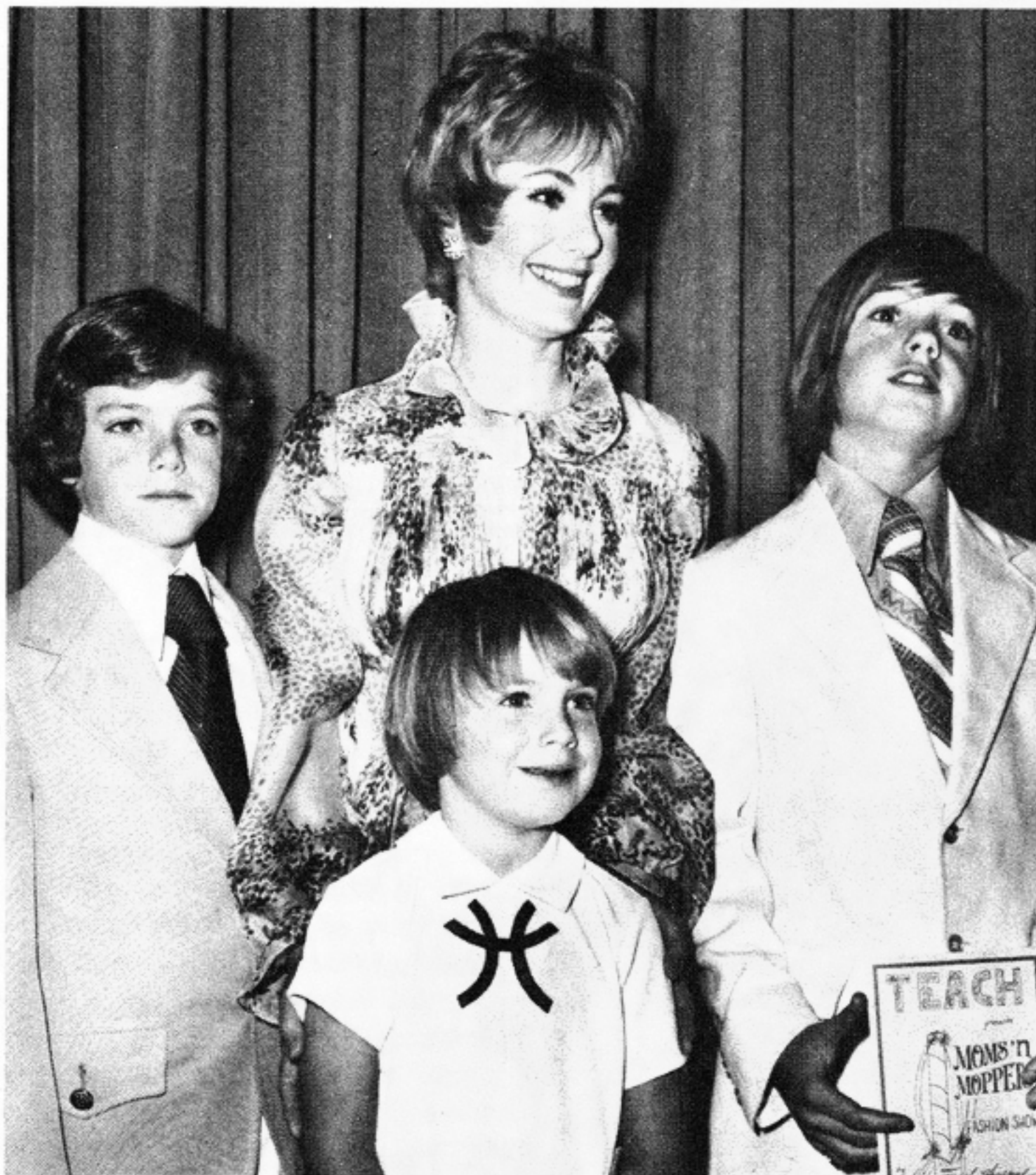
Here is Shirley Jones, surrounded by the men in her life—sons, Shaun, Patrick and Ryan.