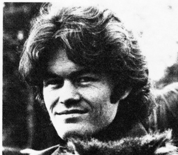
Have you heard Micky Dolenz' new record? He's also in two new motion pictures.

BOBBY SHERMAN's "Mod Squad" segment brought the show its highest rating ever and he's being brought back to star in the opening "MS" show of the new season. Watch for this coming up next fall, but don't bother to believe any of the crazy stories that Bobby's been asked to or is thinking of joining the program as a regular.