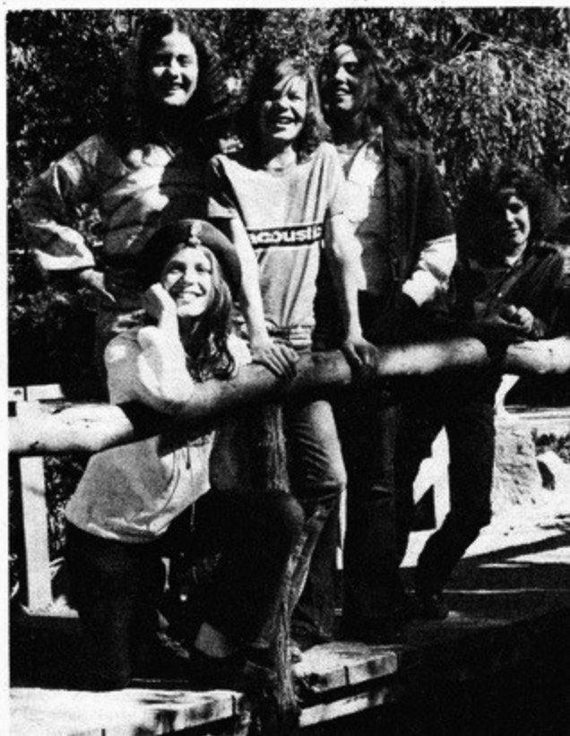
Waldorf Salad is a tasty group of pre-teen rockers.

The BRADY KIDS are off on their May and June concert tour of the East and West coasts, and when they return they'll really be off! It's definitely been decided that the first two weeks of next season's shows will be shot on location in Japan and Hong Kong. The KIDS are absolutely ecstatic,