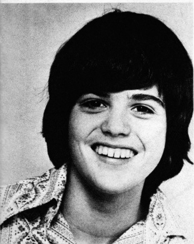
Guess who Donny traded autographs with?