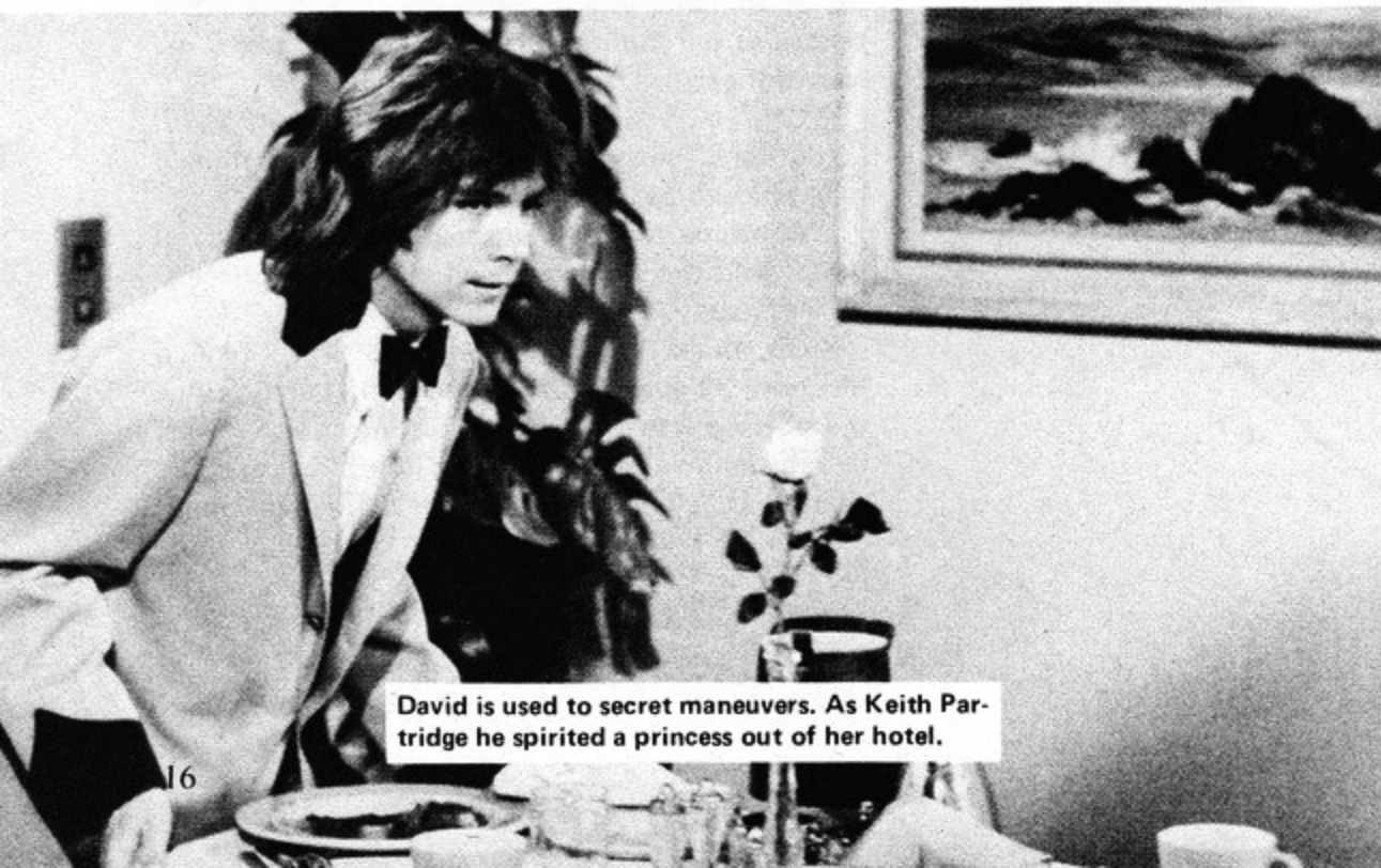
David is used to secret maneuvers. As Keith Partridge he spirited a princess out of her hotel.

POINT 1 David, who had done many rollicking-frolicking rock concerts ever since the show was aired, all of a sudden has stopped giving concerts in the USA last year. He even canceled a few shows that he had promised to give and refunds had to be sent to his disappointed fans. Everyone enjoyed his concerts so much that David's press people said after a few months David would start giving them again. Well, about a year has passed now, and David hasn't given any more concerts in this country. He went to Great Britain this past March and gave concerts in a few countries of Western Europe. But that was all. Naturally, speculations ranged far and wide. David, of course, had been (continued on page 64)