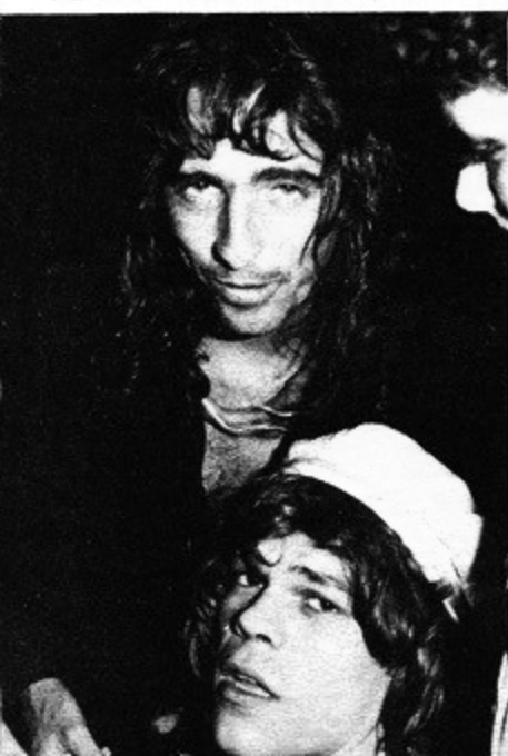
DAVID GATES OF BREAD