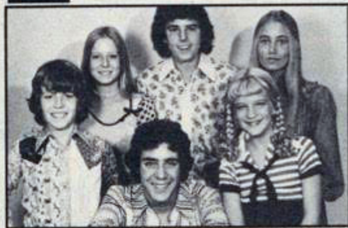
THE BRADY KIDS

A They sure do. All the Brady kids can be heard.