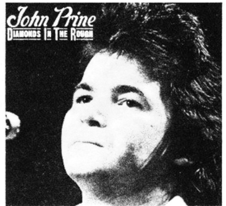
John Prine's Diamonds In The Rough

weave their way into your thinking and your feeling. He'll tickle your funny bone in such songs as Yes I Guess They Oughta Name A Drink After You and Everybody , and you'll find yourself in tears on cuts like Billy The Bum and Rocky Mountain Time . John Prine is a mighty powerful man and will undoubtedly go down in history as a "poet of the times." Get to know him.