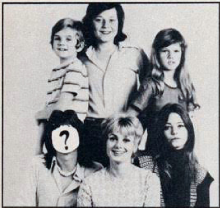
THE PARTRIDGE FAMILY

READ ALL ABOUT IT—The place you'll find the answers to all those rumors!