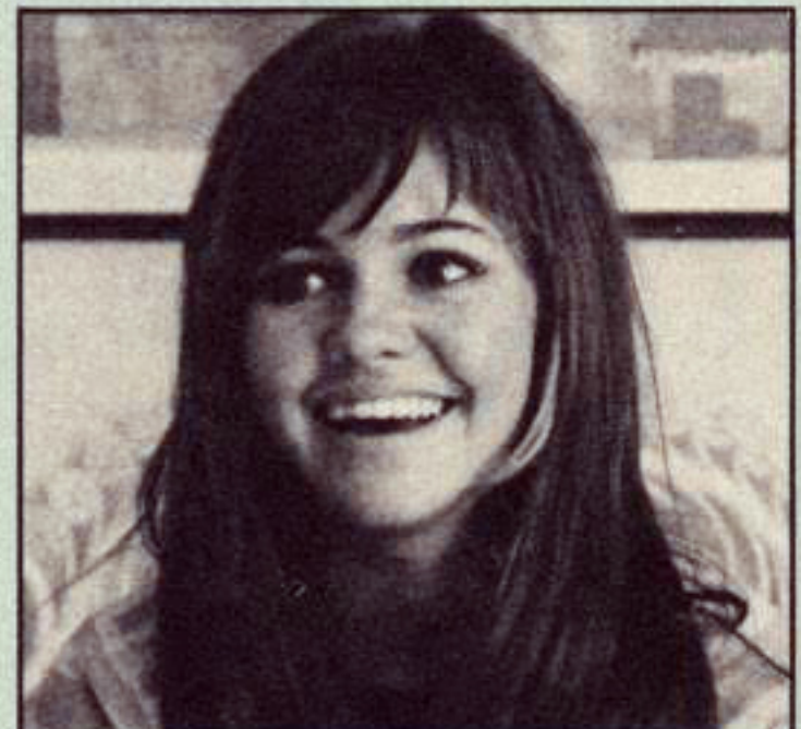
THE GIRL WITH something extra — that's Sally Fields, right?

cific Ocean from the Malibu pier. On one particular Sunday afternoon, RANDY was recognized by several of his fans and the next thing he knew a crowd had formed and there was such a commotion, that it scared all the fish away! . . . KEVIN TIGHE , while on hiatus from Emergency , is spending his vacation period in India. He promised to bring back some unusual trinkets and we are anxiously awaiting his return. . . . Speaking of India, the first segment of The Brady Bunch is being filmed on location there. The kids were really excited about going so far away on location. We hear the plot concerns a kidnapping—be sure to watch on ABC, Fridays at 8:00. . . . Good looking JOHN CALVIN spent the summer in Dallas, Texas, proving he can act on the stage as well as in front of the cameras. He starred opposite E. J. PEAKER (Remember her from Hello Dolly ?) in The Star Spangled Girl . Since The Paul Lynde Show hasn't been picked up ( PAUL will be appearing on Temperatures