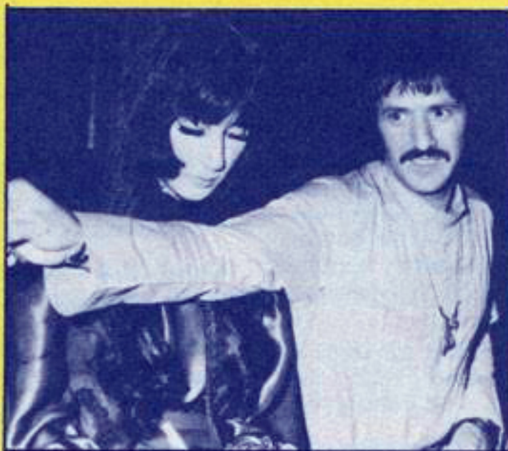
THE GOOD old days. Sonny & Cher aren't so happy recently.