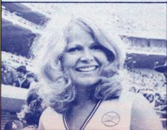
SALLY STRUTHERS has been giggling a lot lately. Someone special?