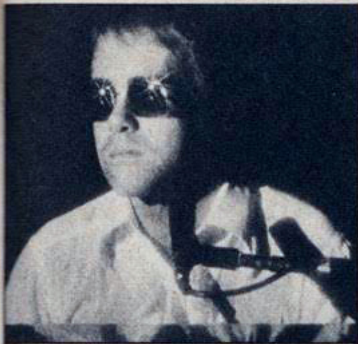
ELTON'S "Yellow Brick Road" is a real record-breaker! He looks great in a red feather boa, too!