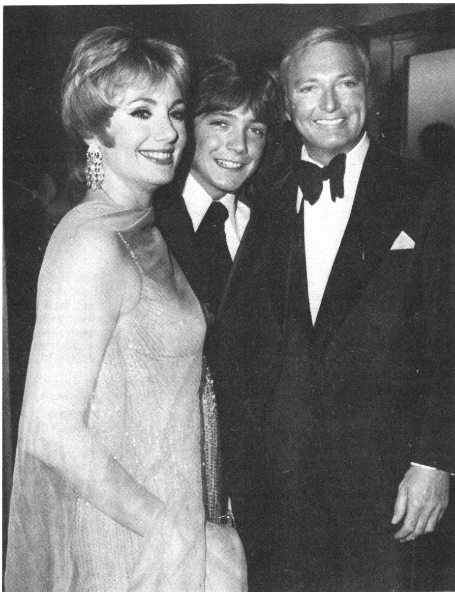
The late Jack Cassidy, with Shirley and son David at an Emmy Awards ceremony. They were divorced before his tragic death in a hotel fire last year.