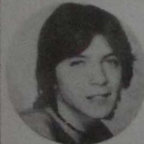
4. colour sticker: (approx. 3") 15p Also available as a pin-on badge. Ref. 4B - 25p

POSTAGE & PACKING: One poster 15p, two or more 20p Or, send just 12p for our full illustrated colour catalogues, listing hundreds of posters and prints.