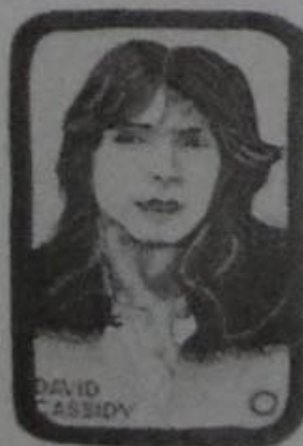
5. Sew-on patch: (approx. 3") 35p