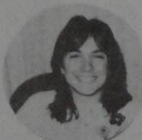
6. colour sticker: (approx. 3") 15p Also available as a pin-on badge. Ref. 6B - 25p

POSTAGE & PACKING: Add 5p to your TOTAL order. Or, send just 7½p for our full illustrated colour brochures. Listing all the patches and stickers we have available.