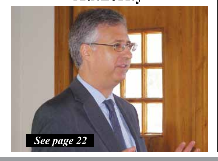
Chamber Schedules 'Com munity Conversations;' First is Candidate Forum