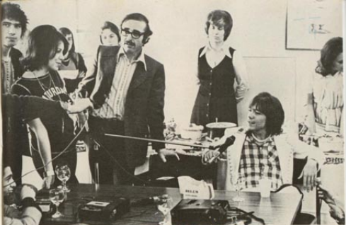
Press conferences aren't all bad—or good—for any artist.