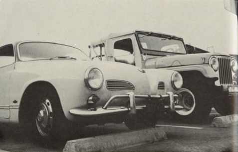
As well as a lot of learning in that first season, David also received a few presents...like the car above!

David Cassidy is, and, just to prove it, consider his birthday celebration for a minute.