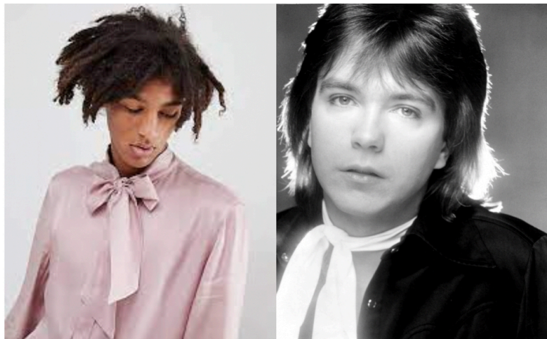
Figure 8: It’s a wrap... or is it? Time will tell how the pussy-bow pendulum will swing. Left: ASOS product shot of Gucci knock-off “regular fit shirt with pussy bow in pink.” Right: Cassidy, circa 1975, image from an RCA publicity photo. Collage by the author.

When we imagine an apparently heterosexual male as a nonbinary icon who did not identify himself as such, we open up our thinking to new possibilities and are able to ask new questions about gender and gender expression. If a teenager styles her hair after a man’s without an awareness or intent that she is reversing traditional expressions of gender, does that make her less genderfluid, or diminish Cassidy’s ability to inspire nontraditional choices? If 1970s moms let their sons grow their hair long because they liked Keith Partridge’s shag but not Ziggy Stardust’s orange-red one, does that make either Davids less or more non-binary? What might we gain by not using a name?