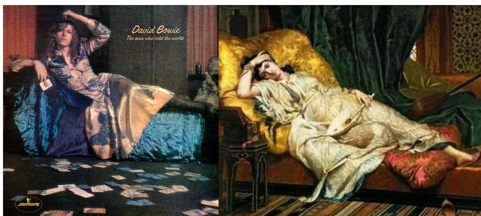
Figure 1: Left: Bowie as posed on the cover of his 1970 album, The Man Who Sold the World ; right: Odalisque with a lute , Hippolyte-Dominique Berteaux, 1876. Image of album is official scan of 1971 UK pressing of album.

The image is well-known and often cited: The singer draped on a chaise covered in iridescent, almost-midnight satin; designed by Michael Fish, his shin-length dress a silver-gold splashed with blue florals. Two pairs of knotted buttons resembling traditional Chinese pankous fasten at his chest, as smooth as, its sheen the same as, the garment’s. Long gold hair sculpted in waves and curls.