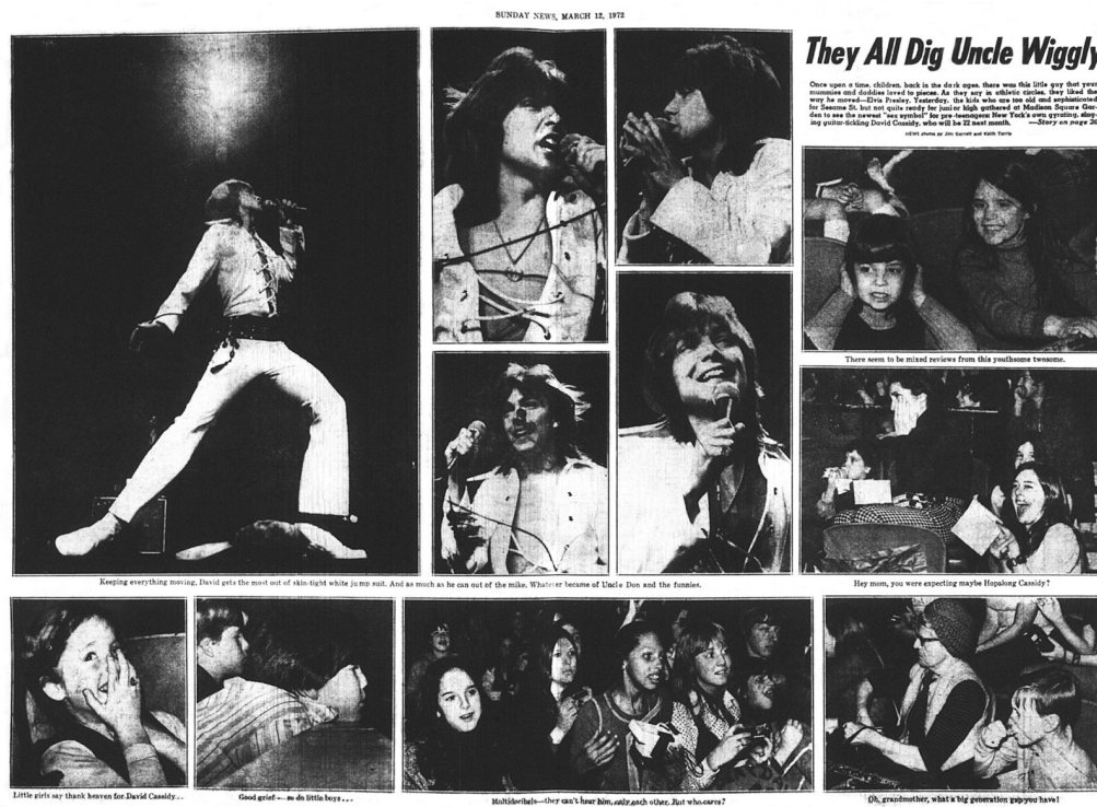
Figure 4: The New York Daily News, March 12, 1972. From davidcassidy.com, https://www.davidcassidy.com/fansite/InPrintPages/News1972March12_NewYorkDailyNews1.pdf .

space represents a subversion of gender norms.