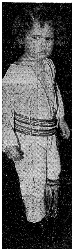
Figure 5: Taken outside of Madison Square Garden, March 11, 1972, published in article: Taylor, Angela. “David They Yelled and Parents Quietly Paid.” The New York Times , March 13, 1972.

On the opposite end of the spectrum, a discussion of gender and fashion becomes even more interesting when considering age. Entwistle notes that fashion’s preoccupation with gender “starts with babies and is played out through the lifecycle, so that styles of dress at significant moments are clearly gendered.” 30 Some might expect a toddler girl to choose, say, a pink tutu for dress-up and play. As documented evidence of Cassidy’s influence on traditional gender norms, what of this photograph of a very young fan who came dressed for the concert in a white lace-up jumpsuit just like his? “The fans love David Cassidy”, read the caption accompanying the photo as captured by The New York Times . “They buy his banners, copy his hairdo and wear his white suit in the 2-year size.” 31