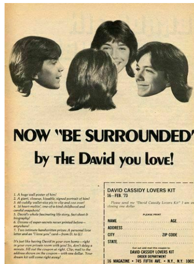
Figure 7: 16 Magazine, February 1972.

The last two examples offer insight into the profound, yet unexplored influence that Cassidy and his shag haircut had on both male and female youth in the 1970s — a time when long hair was very much considered a female trait.