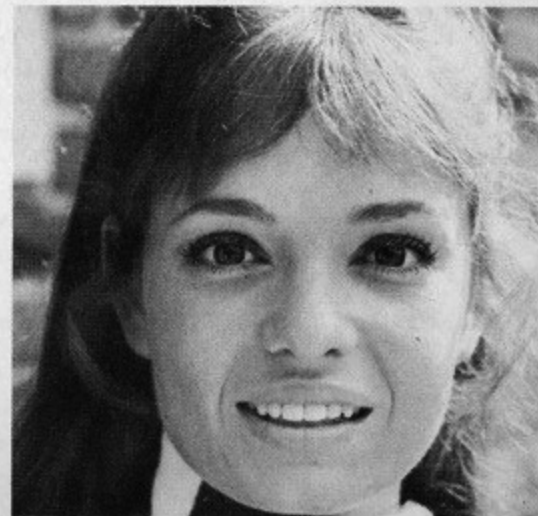
KAREN VALENTINE —mini over midi.