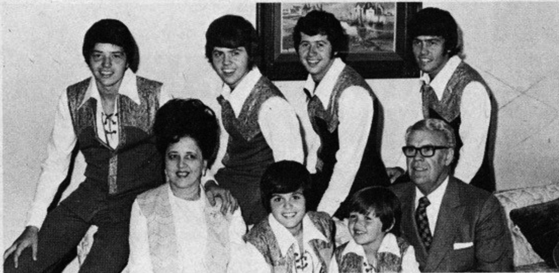
OSMOND BROTHERS proudly show off their folks at a recent record party.