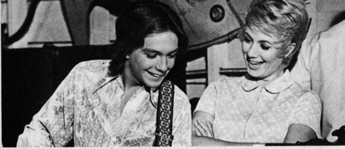
SHIRLEY JONES & DAVID CASSIDY have a ball with "Partridge Family" music.

Citizen's National Bank. Here in California, the song's played quite a bit on television, whenever the Bank's ads come on. It's really a nice sound, goes something like "You've only just begun to live." The CARPENTERS had another record on the charts a while back in time. The radio stations have been playing it quite a bit now so maybe you've heard it. It's a slow version of the BEATLE's "Ticket to Ride" . . . DINO, DESI and BILLY have put out a new sound too. After a couple of years of zero, they've come up with a hit, "Lady Love." Also, they've gone into producing. DINO and BILLY wrote and produced DINO's dad DEAN's newest easy listening single "Come On Down" . . . Another group making news is the DAVE CLARK FIVE . Remember