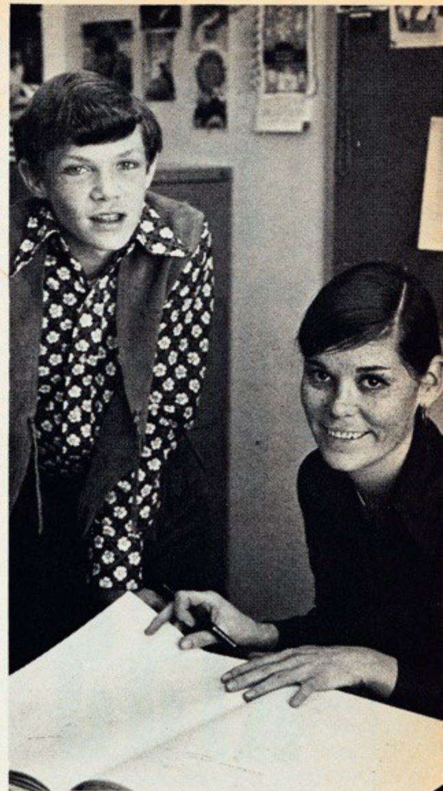
AFTER WATCHING me work on FaVE, Mitch Vogel says he'll stick to acting!

to be called by his real name which is Jan . "I've always liked it better, but when I first got an agent he thought it sounded unmasculine and I went along with him." Not that Michael . . . I mean Jan . . . could ever mix you up on that score!