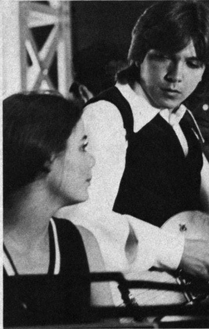
SHE IS VERY patient, even when we rehearse the same song twenty times.