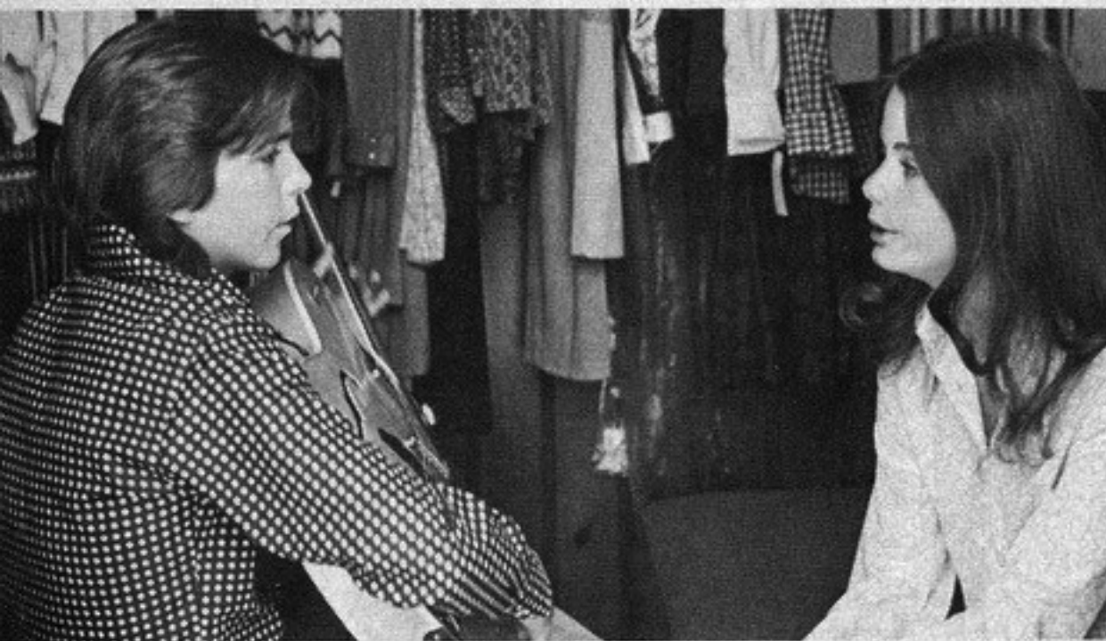
HERE WE ARE going over a number for the show during a break. Look at all the clothes in her dressing room!