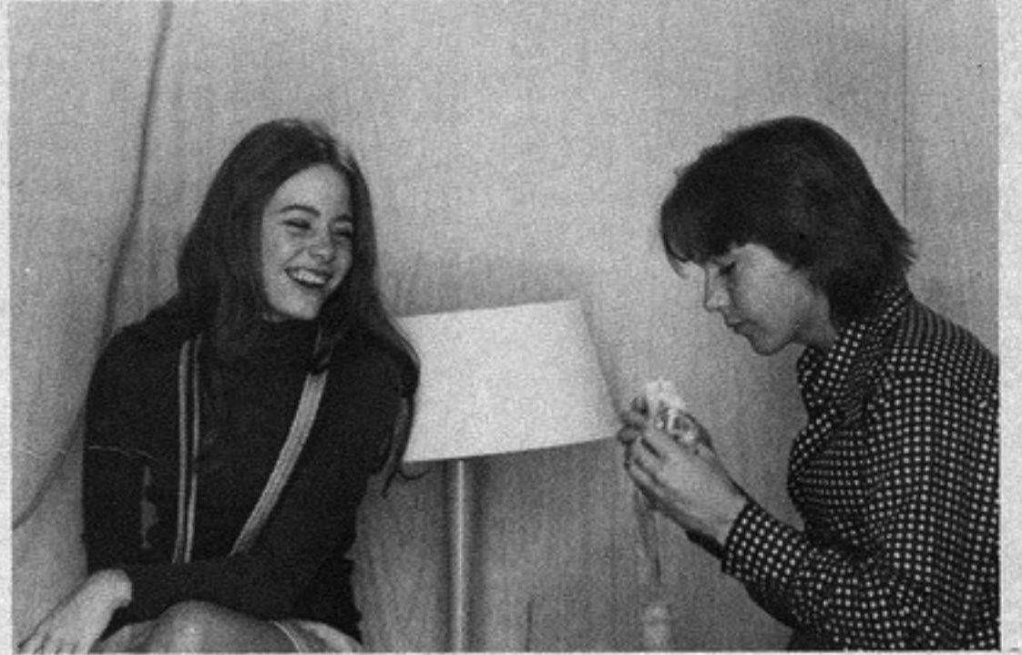
HAVING LUNCH together is almost a daily thing for us. Sometimes, if we have long enough, we eat at a restaurant.