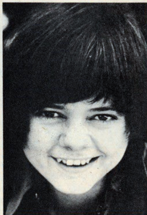
DON'T MISS Jack's first solo album on Capitol! Called "The Jack Wild Album," it also includes a poster!

by "finally repainting an antique bathtub I bought ages ago! I have it filled with yellow and white daisies and it's out by the pool!"