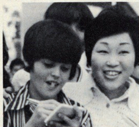
WE WERE TAKEN on a special guided tour of Expo '70 that was just great. We all found something we liked best.