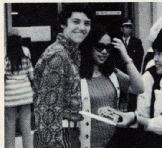
JAY'S FAVORITE WAS the Toy Pavilion—an exhibit all about toys! Merrill liked the movie exhibit.