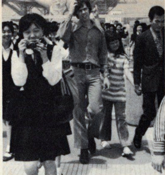
OUR MOM AND DAD came along to Japan with us. We also had two wonderful guides who showed us so much!