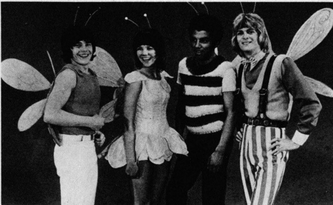
If the Bugaloos flew past you the first time around, they'll be coming in for a few more landings.

SELBY , and the rest of the Dark Shadows stars are plans for more movies based on the series. The first, MGM's House of Dark Shadows , was such a hit that it broke attendance records in many of the cities where it played.