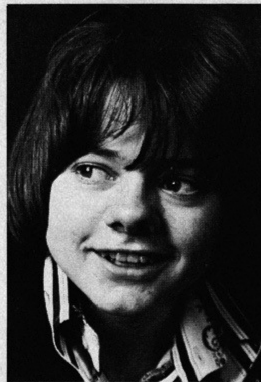
JACK WILD sends his greetings from England where he's now filming a pix with singer Donovan.