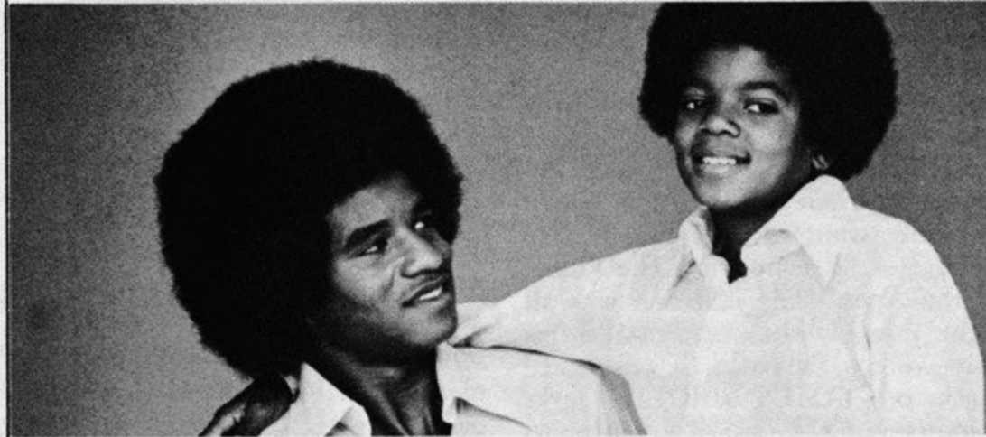
THE JACKSON 5 are currently riding high on the charts with their latest single "Never Can Say Goodbye." The boys are all very close and get along beautifully together despite the difference in their ages—12 years to 20!