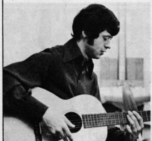
WAYNE OSMOND's so busy these days he can't spend as much time flying his plane as he'd like to.