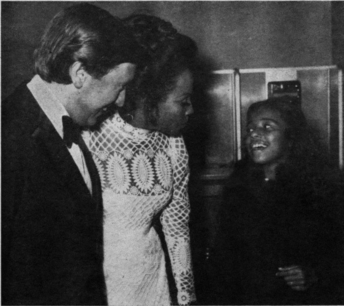
David Frost's steady Diahann Carroll and daughter with him to applaud Emmy win.