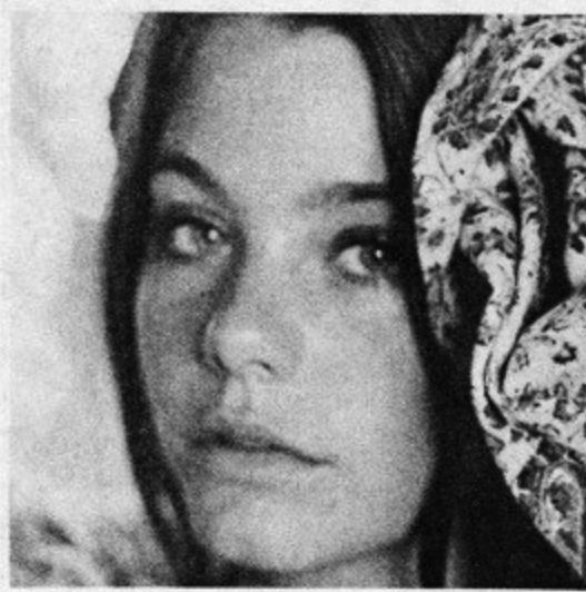
• SUSAN DEY

"This summer will mean fun in a new sort of way. I'll be doing concert tours on weekends. I can't wait!"