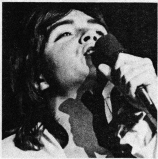
• DAVID CASSIDY

Summer fun means different things to different people. To find out exactly what it means to your faves, we asked them "What does summer fun mean to you?" Their answers were honest and revealing... see how they compare with your ideas on fun in the summer!