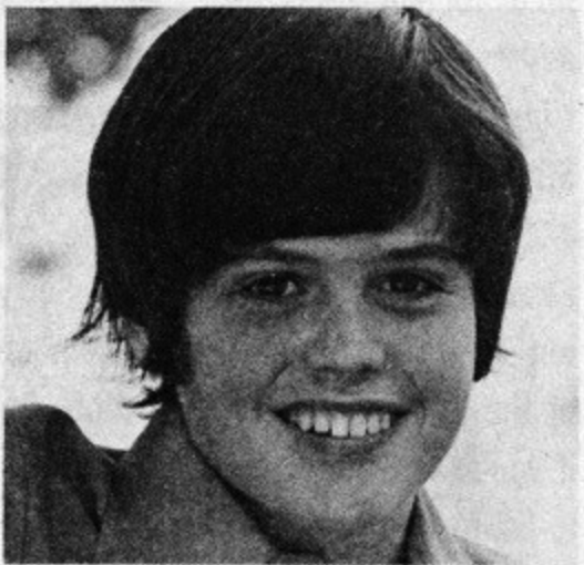
• DONNY OSMOND

"This summer I'll be doing my new show plus squeezing in concerts on weekends, which ought to be exciting!"