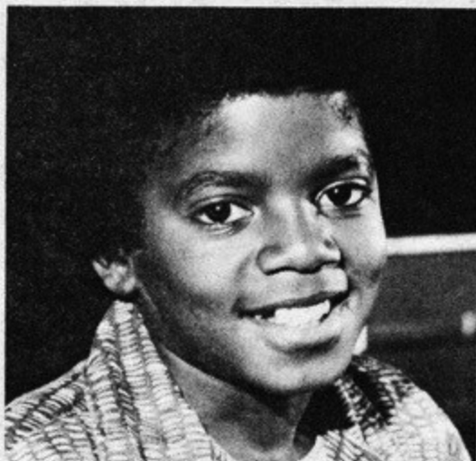
• MICHAEL JACKSON

"Summer fun is visiting the places I never dreamed possible years ago! Touring makes it all come alive!"