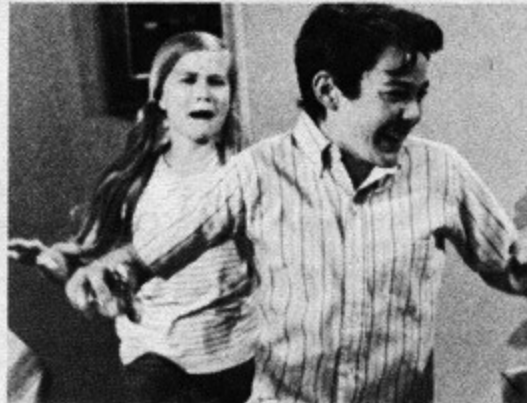
Maureen McCormick Barry Williams