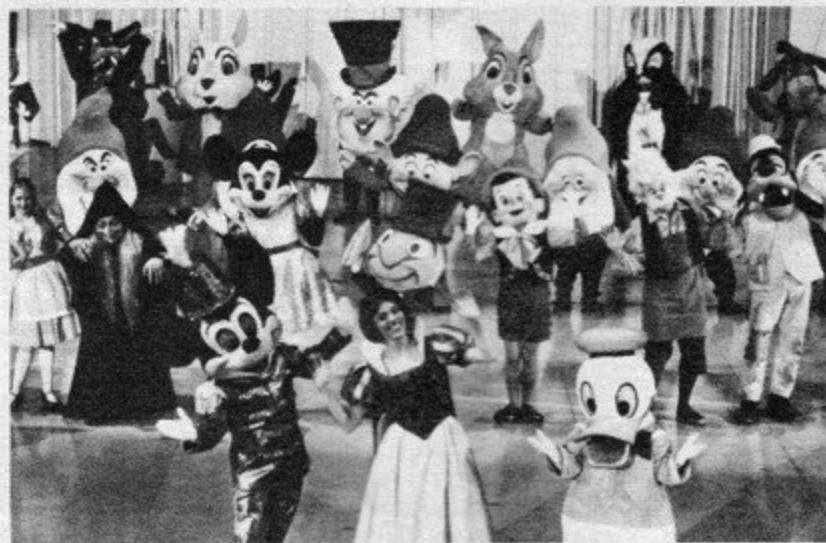
Disney On Parade