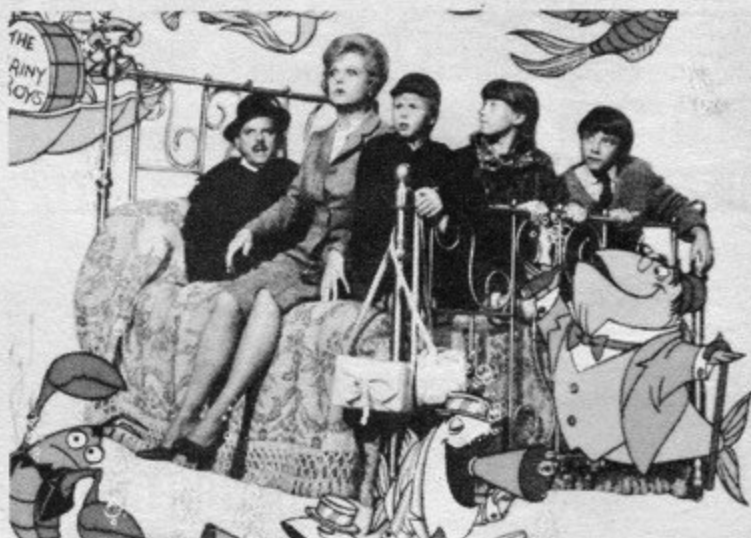
Bedknobs And Broomsticks