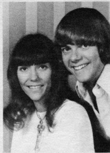
Karen & Richard Carpenter