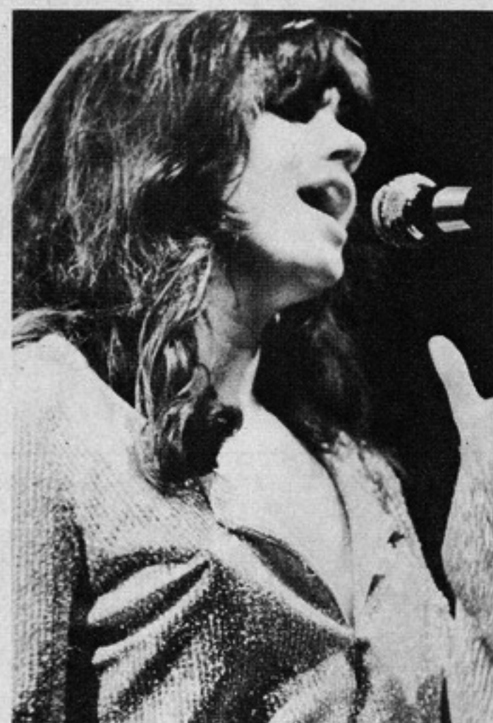
THE CLOTHES she wears on TV get LINDA RONSTADT in a fix sometimes!