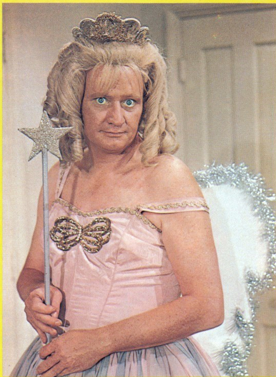
Would you believe it's Dave Madden? For one episode of the show he has to wear this funny "good-fairy" costume, that made everyone break up laughing!