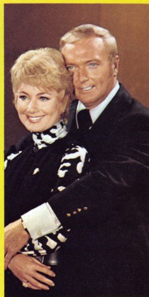
Shirley and her husband Jack Cassidy were a hit on the Merv Griffin Show.