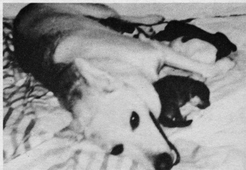
"Heesh" & family!