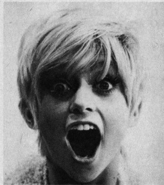
GOLDIE HAWN will have her own TV special in February called "Pure Goldie." Should be a pure delight!