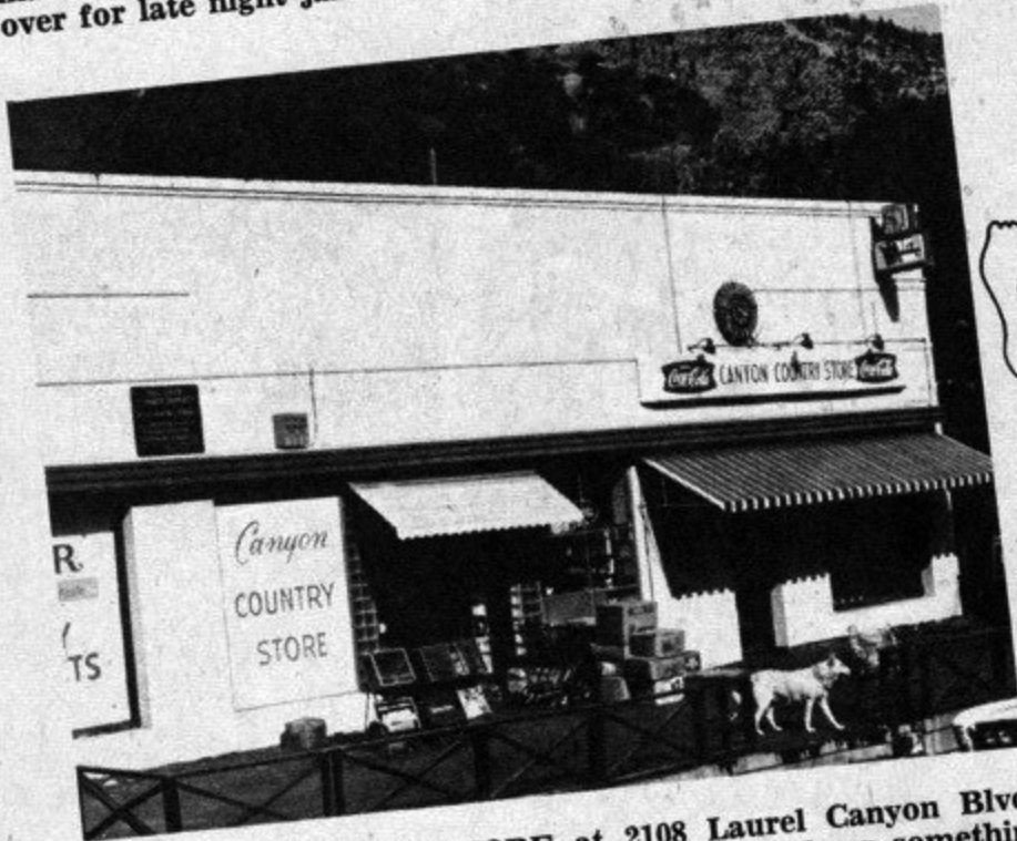
CANYON COUNTRY STORE at 2108 Laurel Canyon Blvd., where David often stops on way home to pick up something quick for dinner. Most of Canyon's residents stop by store!