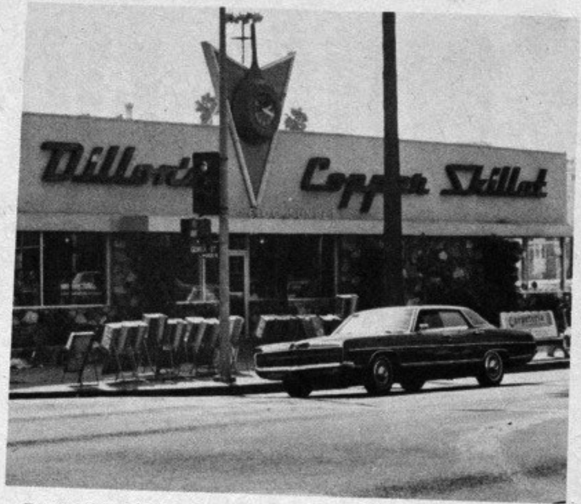
DILLON'S COPPER SKILLET , at 6100 Sunset Blvd., in Hollywood, is where David goes for lunch at 1:00 p.m. if he's filming at Screen Gems. It's down the block.