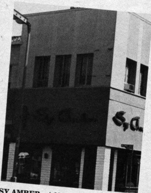
SY AMBER , at 6648 Hollywood Blvd., is a groovy men's shop David likes to browse around in on way home!