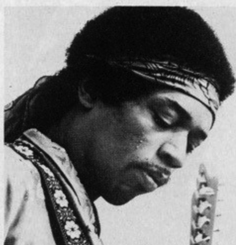
JIMI HENDRIX —we'll miss him.