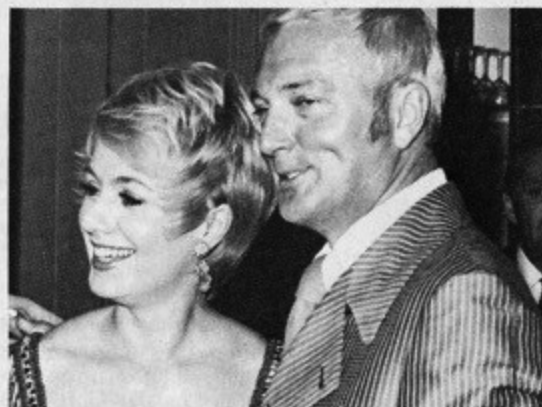
THE JACK CASSIDYS —nice rest.

were waiting for him in Hawaii. DAVID told several of the trade papers in Hollywood he was going there for some surfing. "Throwing them off-track so I can be alone," DAVID called it. Smart Man. Meanwhile, DAVID's Dad JACK CASSIDY and his step-mother SHIRLEY JONES retreated to the wilderness to take in some fishing "and just plain relaxing," SHIRLEY said... DONNY OSMOND was rushed to the hospital with a blistering fever and FaVE's got the whole true story for you in this issue! The OSMONDS will be on several television specials this season. The first