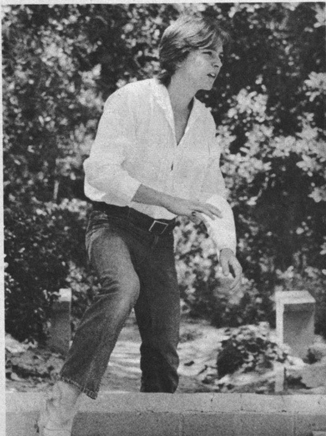
David Cassidy's running from a serious romance—for the time being!