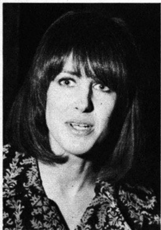
Grace Slick's a "good deed" doer!